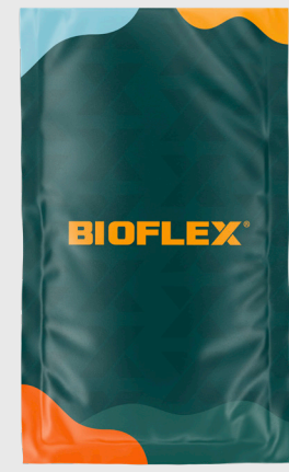
Pillow bags, Sachets and more