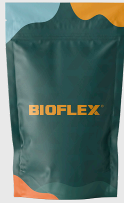
Stand up Pouches